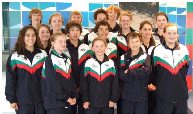
Pacific School Games – Nunawading Swimmers

I am now training hard to try to make the Victorian team to go to Perth in September for the National School Championships.